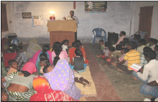
Victims of devastation being fed spiritually as well as physically.

schools that meet in villages or city suburbs in the evenings three or four times a week or on Saturdays to accommodate brothers who work full-time. Two special schools meet one full week out of the month.