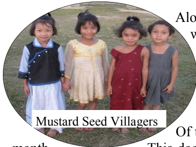
Mustard Seed Villagers